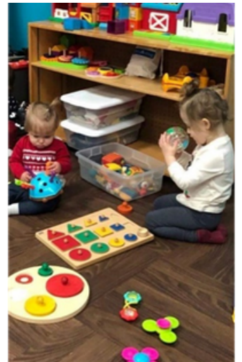
Our last day at the Centre