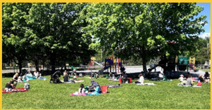
(Mud Kitchen FUN, Halloween Treat Pickup, Picnic in the Park - Pasadena)