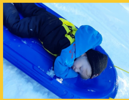
(Storytime on the Trail, Storytime in the Snow, Nap time! – Deer Lake)