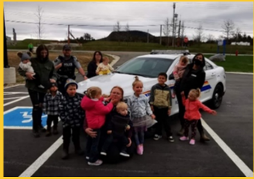
Photos L-R; (World Oceans Day - Trout River, Fire Prevention/Police Week – Gros Morne)