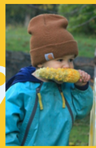
(YES!! Community Events; Community Bonfire, Tree House Corn Boil)