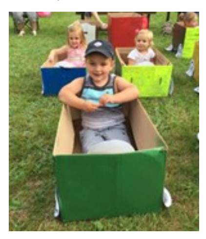
Stroller Fit This program is offered on a weekly basis in Pasadena and Deer Lake.

(Deer Lake) This is a new evening program that began this summer. The program is hosted every two weeks. During the first Fam Jam they had a "drive-in" movie theatre. Others included; Game night (child friendly Pokemon Go, Yard Yahtzee, etc) and Camp-out (a few tents, campfire sing-along & smores).