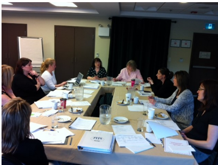
NLFRP Board Meetings which took place in Deer Lake in June 2015.

It has been another busy year for the NLFRP. Work is being done to revise the work plan for 2015-2017 .